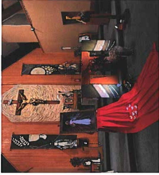
St. Teresa of Avila Parish, Kitchener